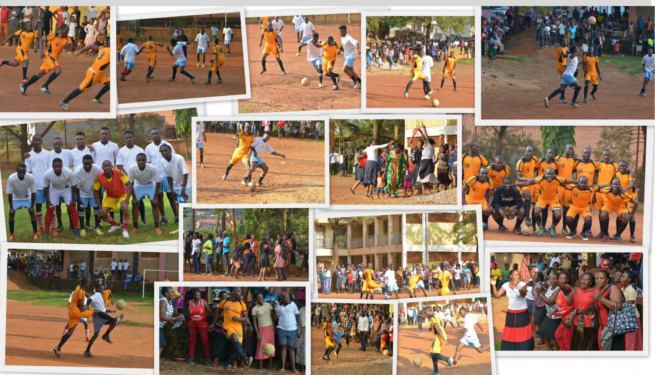
Pictorial from the Fathers Vs Boys football match

The match was extremely intense and remained tied for a long time with either side making dangerous attempts at the others 'goal post. Eventually the singles managed a very narrow and lucky win. However, the marrieds felt like winners too.